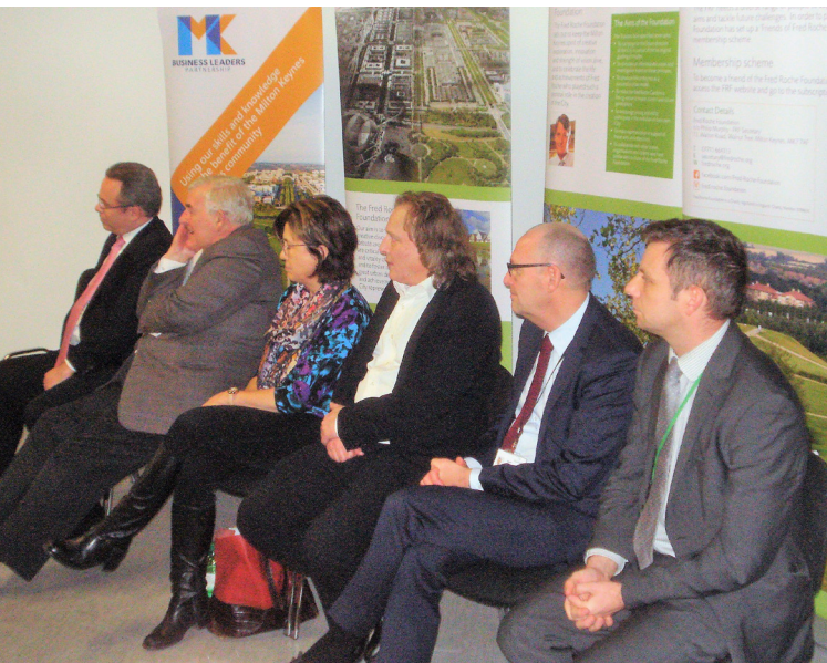
Going Places Event Panel