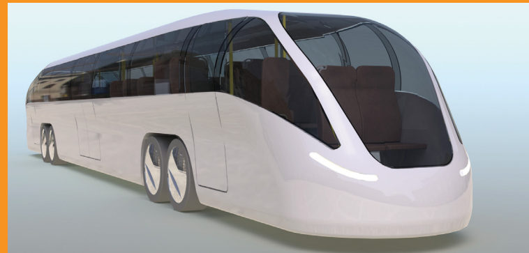
An Advanced Very Rapid Transit system could be a future mobility solution for MK

A small group of BLP/FRF members will finalise a response to the Council's Mobility Strategy which closed on 12th February.